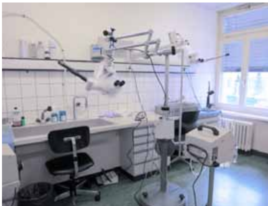
Temporal bone Dissection Laboratory